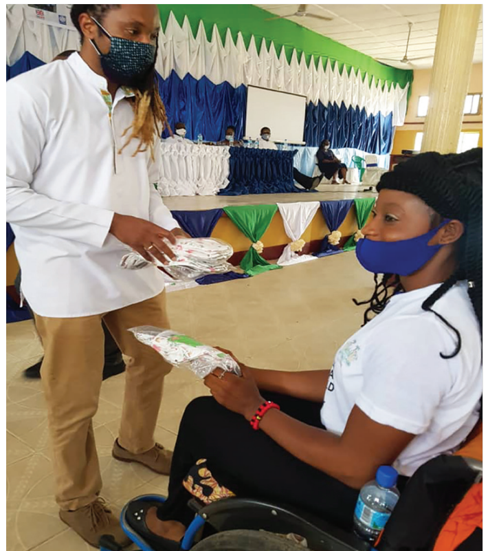
Education Minister of Basic and Senior Secondary Education, David Moinina Sengeh, launching nationwide hygiene kits in October 2020.

David Moinina Sengeh , Minister of Basic and Senior Secondary Education.