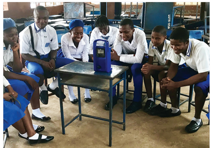
Children listening to the radio at a Girls and Boys Club.

Previously gender segregated Girls Clubs and Boys Clubs had been established for a limited number of children, facilitated by teachers using a guide. However, taken as an extra lesson rather than to engage children, the Clubs had proved ineffective due to teachers lacking skills and motivation to take on the work without incentives. In response, Leh Wi Lan supported MBSSE to establish Girls and Boys Clubs in all secondary schools, providing them with wind up and solar-powered radio players. With male and female hosts guiding the sessions, the Girls and Boys Clubs promote respect, equal participation and discussion around gender-based violence, how to identify it, tackle it and report it, in a friendly, engaging and enjoyable environment. The sessions also introduce topics related to sexual and reproductive health and life skills for adolescents (how to manage emotions and communication).