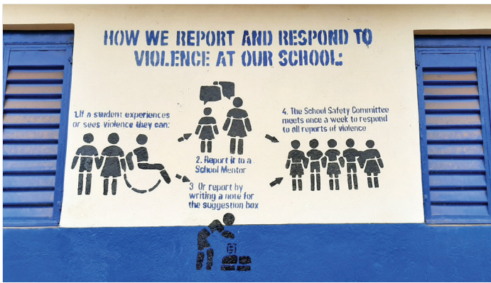
Reporting abuse mural.