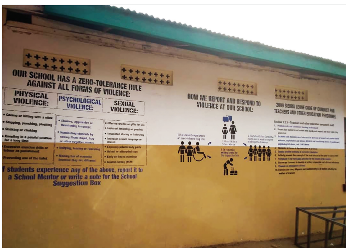
Zero tolerance mural.

Historically, in Sierra Leone's school system there have been many unreported cases of school-related gender-based violence due to lack of awareness of the children about their rights and lack of access to reporting systems. The UNICEF GATE project had established School Safety Committees and introduced a reporting system through suggestion boxes in schools. The intervention was successful but needed fine-tuning. Leh Wi Lan's support to MBSSE included strengthening internal monitoring through School Support Officers and District Inclusion Officers, developing a Reducing Violence in Schools Guide, and by introducing Teachers' Learning Circles as a participative approach to learning. School Murals were also painted to depict the roles and rights of school staff and students and, to increase teachers' awareness of their roles and responsibilities, the Teacher Code of Code was disseminated to all secondary schoolteachers.