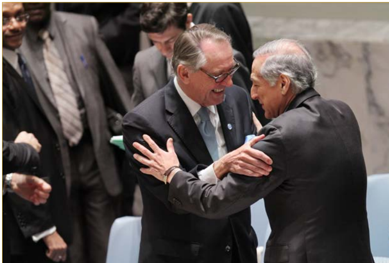
Deputy Secretary-General Jan Eliasson (centre) greets Heraldo Muñoz, Minister for Foreign Affairs of Chile and President of the Security Council for January, at the Council's meeting on post-conflict peacebuilding. 14 January 2015.

During the 1990s and at a gathering pace in the first two decades of the twenty first century, there was a significant shift away from “top-down” peacebuilding, whereby powerful outsiders act as experts, importing their own conceptions of conflict and conflict resolution and ignoring local resources in favour of a cluster of practises and principles referred to collectively as peacebuilding from below. The conflict resolution and development fields have come together in this shared enterprise. John Paul Lederach, a scholar-practitioner with practical experience in Central America and Africa, is one of the chief exponents of this approach. The priority for peacekeeping and conflict resolution is to develop widening participation and local ownership of peacekeeping deployments and to strengthen and balance the civilian content and capacity of missions with the core military composition typical of conventional peacekeeping. These developments are dealt with in Lesson 8. In the past two decades, also as part of this trend of wider participation and local ownership, efforts have been made to make peacekeeping open to more sensitivity to cultural values and diversity, including gender equality.