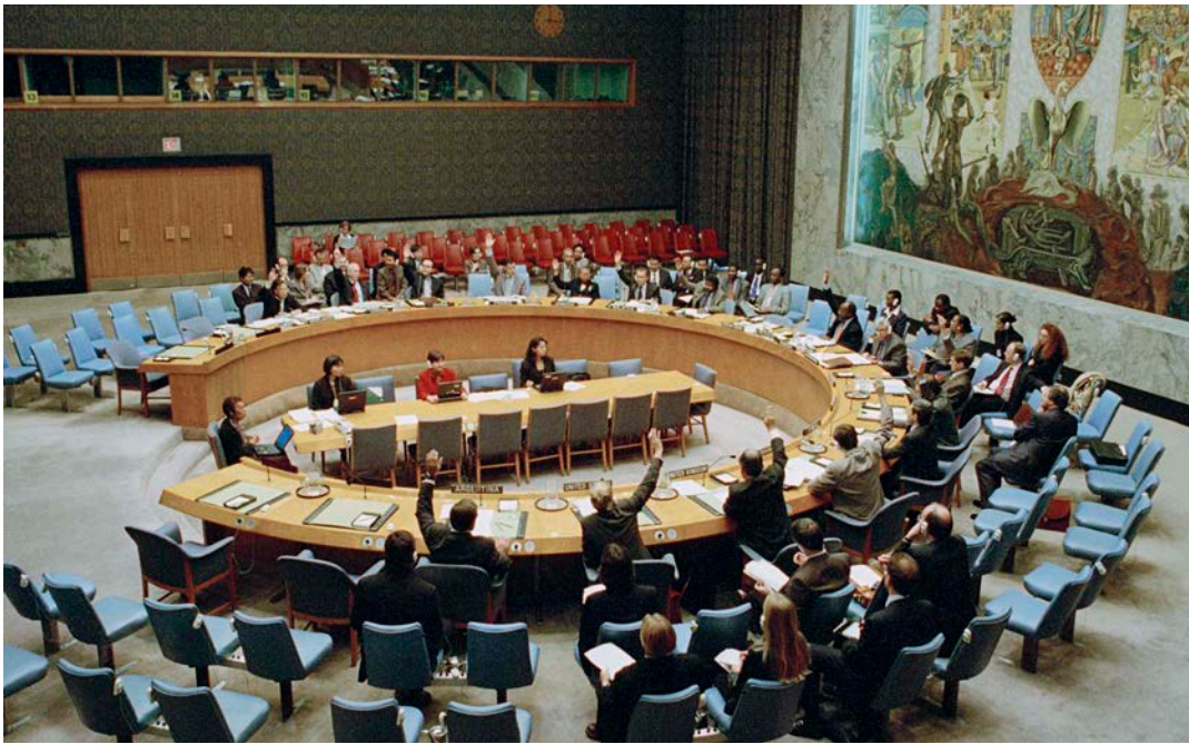
The Security Council adopted resolution 1325 (2000), urging an enhanced role for women in preventing conflict, promoting peace and assisting in post-conflict reconstruction within United Nations operations. The resolution calls on all actors involved to adopt a gender perspective when negotiating and implementing peace agreements, and further calls on all parties to armed conflict to fully respect international law applicable to the human rights of women and girls, as civilians and as refugees. A general view of the meeting as the vote is taken. 31 October 2000.

civic culture that is receptive to the voices of people and cultural communities who are not part of the traditional discourses of nation-state politics. In doing so, Boulding anticipated many of the preoccupations of conflict resolution participants today (e.g., local communities, women). For Boulding, the next half of our “200 year present” (i.e., the next one hundred years from the 1980s) contains within it the basis for a world civic culture and peaceful problem-solving among nations, but also the possibility of Armageddon. The development of local and international citizens’ networks could be a way of ensuring that the former prevailed.