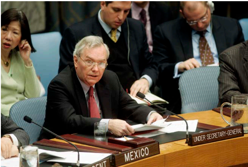
B. Lynn Pascoe, Under-Secretary-General for Political Affairs, addresses a Security Council meeting on mediation and settlement of disputes. 21 April 2009.

of problem-solving, initially referred to as “controlled communication”: a group based at the University College, London, a group at Yale University and, later, a group at Harvard University. The first attempts to apply the problem-solving method were in two workshops organized by the London group in 1965 and 1966. They were designed to address the conflicts between Malaysia, Singapore and Indonesia, and between the Greek and Turkish communities in Cyprus, respectively. One of the facilitators of the second workshop was Herbert C. Kelman, a leading social psychologist who formed the Program on International Conflict Analysis and Resolution at Harvard. He went on to become the leading practitioner-scholar of the problem-solving method over the next thirty years, specializing in the Israeli-Palestinian conflict. Kelman’s series of Arab-Israeli interactive problem-solving workshops (1974-91) had an important influence on the eventual conclusion of the Oslo Accords in 1993.