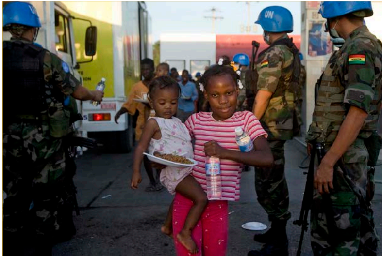
Bolivian United Nations peacekeepers distribute water and meals to the residents of Cité Soleil, Haiti. 15 January 2010.

good communication, negotiation, mediation. These consent-promoting techniques constitute the “soft” skills and processes of peacekeeping—as opposed to the “hard”, or technical and military skills—designed to win hearts and minds.