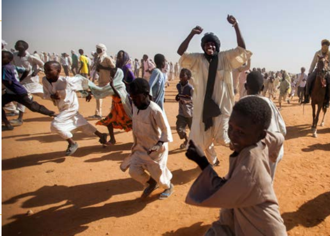
The African Union-United Nations Hybrid Operation in Darfur (UNAMID) hosted a cultural and sports event in El Sereif, North Darfur, as part of its "We Need Peace Now" campaign. Spectators cheer following a horse race held as part of the cultural and sports event. 20 May 2014.

response to many complex violent conflicts. It has taken on unfamiliar roles in prevention (UNPREDEP in Macedonia), intervention in active war zones (UNOMIL in Liberia, UNPROFOR in Bosnia, UNOSOM in Somalia), as well as post-settlement peacebuilding (ONUSAL in El Salvador, UNTAC in Cambodia, ONUMOZ in Mozambique). Consequently, it has become more common for Conflict Resolution theorists to refer to peacekeeping as an important instrument of positive conflict transformation. In this sense, peacekeepers (military and civilian) are increasingly required to use psychological and communications strategies over the use of military force. In the same way, one of the striking features of recent analyses by practitioners of peacekeeping has been the frequency with which they refer to the relevance of aspects of conflict resolution.