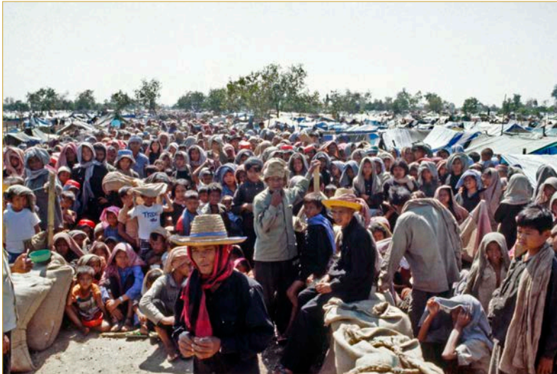
In the late 1970s war and civil strife had devastating effects on Kampuchea, causing hundreds of thousands of people to flee their homes and seek food and refuge in neighboring Thailand. UN relief agencies and cooperating independent groups responded to the crisis by helping to establish refugee camps along the border and taking in food, medical supplies and other essentials. Some Kampuchean refugees living in crowded conditions along the Thai-Kampuchean Border. 1979. 01 January 1979.

What made it possible to unlock these intractable conflicts for Burton was the application of human needs theory through the problem-solving approach. Needs theory holds that deep-rooted conflicts are caused by the denial of one or more basic human needs, such as security, identity, and recognition. The theory distinguishes between interests and needs: interests, being primarily about material goods, can be traded, bargained and negotiated; needs, being non-material, cannot be traded or satisfied by power bargaining. However, non-material human needs are not scarce resources (e.g., territory, oil, minerals, and water) and are not necessarily in short supply. With proper understanding, conflicts based on unsatisfied needs can be resolved.