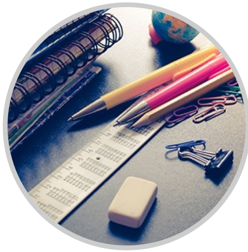
Tips & Tools