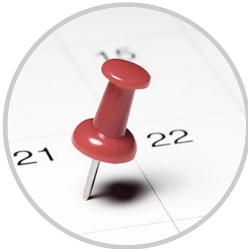
Workshops & Groups