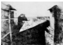
Original lossless version

This is a featured picture on Wikimedia Commons ( Featured pictures ) and is considered one of the finest images.