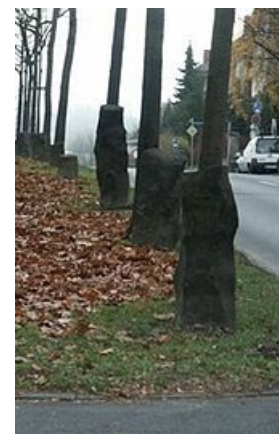
Some of the 7,000 Oaks planted between 1982 and 1987 for Documenta 7 (1982)

"Only on condition of a radical widening of definitions will it be possible for art and activities related to art [to] provide evidence that art is now the only evolutionary-revolutionary power. Only art is capable of dismantling the repressive effects of a senile social system that continues to totter along the deathline: to dismantle in order to build 'A SOCIAL ORGANISM AS A WORK OF ART'... EVERY HUMAN BEING IS AN ARTIST who - from his state of freedom - the position of freedom that he experiences at first-hand - learns to determine the other positions of the TOTAL ART WORK OF THE FUTURE SOCIAL ORDER." [36]