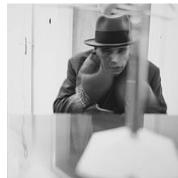
Beuys Felt TV performance by Lothar Wolleh

Beuys's first solo exhibition in a private gallery opened on 26 November 1965 with one of the artist's most famous and compelling performances: How to Explain Pictures to a Dead Hare . The artist could be viewed through the glass of the gallery's window. His face was covered in honey and gold leaf, an iron slab was attached to his boot. In his arms he cradled a dead hare, into whose ear he mumbled muffled noises as well as explanations of the drawings that lined the walls. Such materials and actions had specific symbolic value for Beuys. For example, honey is the product of bees, and for Beuys (following Rudolf Steiner), bees represented an ideal society of warmth and brotherhood. Gold had its importance within alchemical enquiry, and iron, the metal of Mars, stood for a masculine principle of strength and connection to the earth. A photograph from the performance, in which Beuys is sitting with the hare, has been described "by some critics as a new Mona Lisa of the 20th century," though Beuys disagreed with the description.