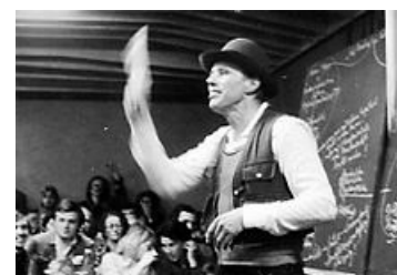
Joseph Beuys on his lecture "Jeder Mensch ein Künstler - Auf dem Weg zur Freiheitsgestalt des sozialen Organismus" in Achberg, Germany, 1978

At the Düsseldorf Academy of Art, Beuys did not impose his artistic style or techniques on his students; in fact, he kept much of his work and exhibitions hidden from the classroom because he wanted his students to explore their own interests, ideas, and talents. [20] Beuys' actions were somewhat contradictory: while he was extremely strict about certain aspects of classroom management and instruction, such as punctuality and the need for students to take draughtsmanship classes, he encouraged his students to freely set their own artistic goals without having to prescribe to set curricula. [20] Another aspect of Beuys' pedagogy included [20] open "ring discussions," where Beuys and his