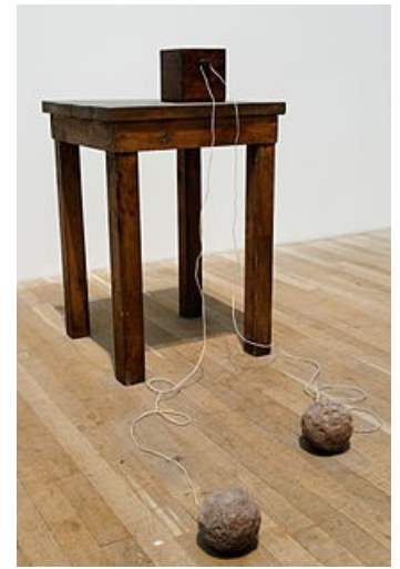
Joseph Beuys, Table with Accumulator ( http://smarthistory.y.khanacademy.org/table-with-a-ccumulator.html ), Smarthistory, in the Tate Modern