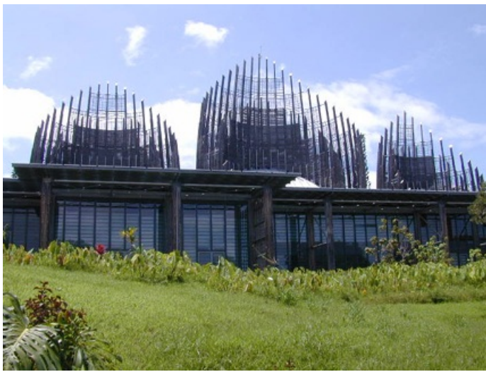
Kari Silloway 2004