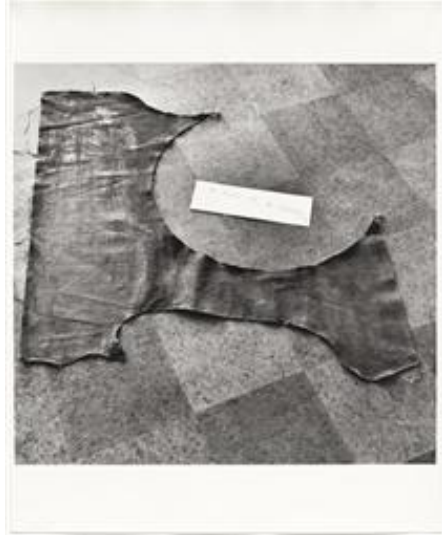
Painting To Be Stepped On