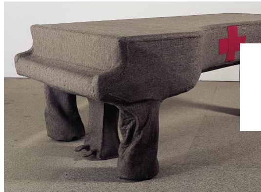
Infiltration for Piano • 1966