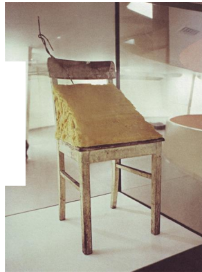
Fat chair • 1964