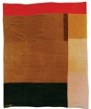
China Pettway, born 1952, blocks, corduroy and cotton hopsacking, ca. 1975, 83 x 70 inches q058-02ab.JPG