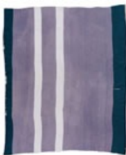
Loretta Pettway, born 1942. "Lazy Gal" - - "Bars," ca. 1965, denim and cotton, 80 x 69 inches. q002-04.jpg