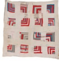
Rachel Carey George, born 1908. "Housetop"--sixteen-block "Half-Logcabin" variation sashed with feed sacks. ca. 1935, cotton sacking material and dress fabric, 86 x 86 inches. q111-07b.JPG