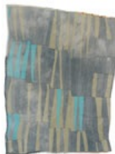
Loretta Pettway, born 1942. String- pieced quilt 1963, cotton twill and synthetic material (men's clothing), 80 x 74 inches. In the early 1960s, Loretta Pettway fashioned three quilts from the same batch of men's clothing scraps. q002-08.jpg