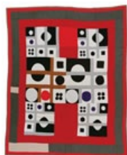
Nettie Young, born 1917. "H"variation (quiltmaker's name: "Milky Way"), 1971, cotton, 88 x 77 inches. q021-06.jpg