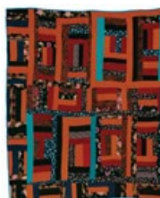
Essie Bendolph Pettway, born 1956. "Roman Stripes" variation, 1997, rayon and cotton, 90 x 80 inches. q008-02.jpg