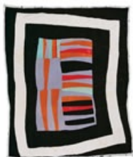
Loretta Pettway, born 1942. Medallion, ca. 1960, synthetic knit and cotton sacking material, 87 x 70 inches. q002- 18.jpg