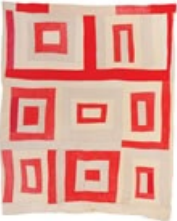
Linda Pettway, born 1929, "Housetop" -- eight-block variation, ca. 1975, corduroy, 86 x 71 inches. q032-08.jpg