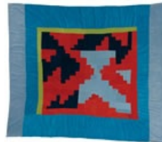
Flora Moore, born 1951. "Logcabin" variation, ca. 1975, corduroy, 83 x 92 inches.q133-02b.JPG