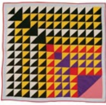
Lucy T. Pettway, born 1921. "Birds in the Air" (quiltmaker's name), 1981, cotton, cotton/polyester blend, 79 x 79 inches. Wiebke q048-21b.JPG