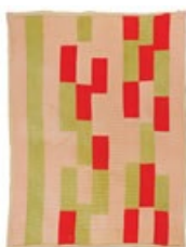
Essie Bendolph Pettway, born 1956, multiple columns of blocks and bars, 1980, corduroy, 93 x 75 inches. q008- 04.jpg