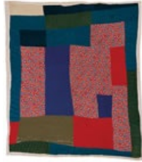
Amelia Bennett, born 1914. Blocks and strips, 1950s, cotton twill, printed and solid corduroy, synthetic knit crepe, 80 x 74 inches q119-08b.JPG