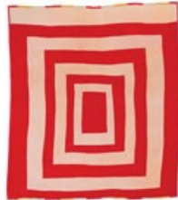
Quinnie Pettway, born 1943. "Housetop," ca. 1975, corduroy, 82 x 74 inches. q033-04a.jpg