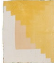
Linda Pettway, born 1929. "Logcabin" -- single-block variation, tied with yarn, ca. 1975, corduroy, 88 x 78 inches. q032-03b.JPG