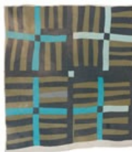
Loretta Pettway, born 1942. Four-block strips, ca. 1960, cotton twill and synthetic material (men's clothing), 78 x 73 inches. Second quilt that is made from the same materials, see housetop. q002-19.jpg