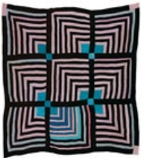
Sue Willie Seltzer, born 1922. "Housetop" -- nine-block "Half-Logcabin" variation, ca 1955, cotton and sythetic blends, 80 x 76 inches. q140-03b.JPG