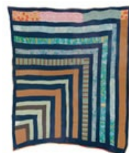
Lucy T. Pettway, born 1921. "Housetop" -- single-block "Half-Logcabin" variation (quiltmaker's name: "Plow Point"), ca. 1945, cotton, 84 x 69 inches. q048-07b.JPG