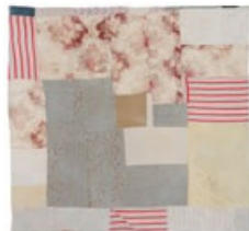
Polly Bennett, born 1922. Blocks, 1942, cotton (dress and pants fabric, curtain material, mattress tickng), 81 x 83 inches. q084-09bb.JPG