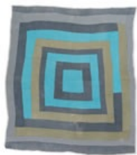
Loretta Pettway, born 1942. "Housetop," 1963, cotton twill and synthetic material (men's clothing), 80 x 74 inches. In the early 1960s, Loretta Pettway fashioned three quilts from the same batch of men's clothing scraps. q002-07.jpg