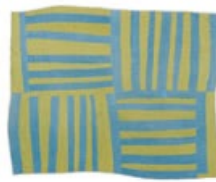
Florine Smith, born 1948, four-block strips, ca. 1975, corduroy, 68 x 81 inches. q050-04b.JPG