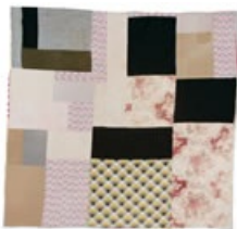
Polly Bennett, born 1922. Two-sided quilt: Blocks, 1942, cotton (dress and pants fabric, curtain material, mattress ticking), 81 x 83 inches. q084-09ab.JPG