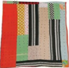
Helen McCloud, born 1938, blocks and strips tied with yarn in a grid pattern. Ca. 1965, cotton, nylon knit, polyester knit, 77 x 82 inches. This is one side of a two-sided quilt. q127-07ab.JPG