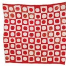
Lucy T. Pettway born 1911 "Snowball" (Quiltmaker's name) Circa 1950 Cotton, corduroy, cotton sacking material 83x85 inches