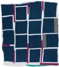
Annie Mae Young, born 1928. Blocks and strips, ca. 1970, cotton, polyester, synthetic blends, 83 x 80 inches. q026-09.jpg