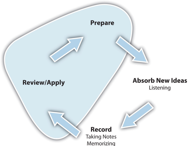
Figure 6.2 The Learning Cycle: Review and Apply

The end and the beginning of the learning cycle are both involved in test taking, as we'll see in this chapter. We will discuss the best study habits for effective review and strategies for successful application of your knowledge in tests and exams. Finally, we will cover how the review and application processes set you up for additional learning.