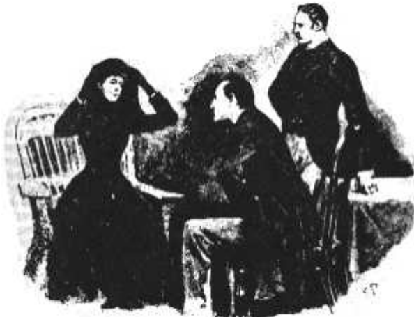
"SHE RAISED HER VEIL"

"It is fear, Mr. Holmes. It is terror." She raised her veil as she spoke, and we could see that she was indeed in a pitiable state of agitation, her face all drawn and grey, with restless frightened eyes, like those of some hunted animal. Her features and figure were those of a woman of thirty, but her hair was shot with premature grey, and her expression was weary and haggard. Sherlock Holmes ran her over with one of his quick, all-comprehensive glances.