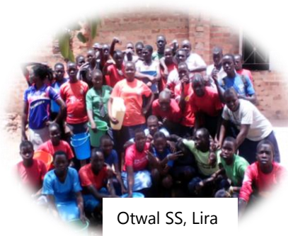
Otwal SS, Lira