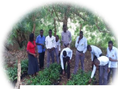
Teso College, Soroti-Serere