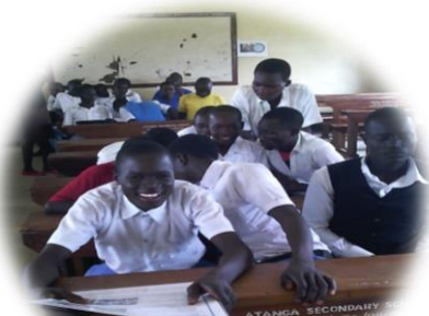
Atanga SS, Kitgum-Pader