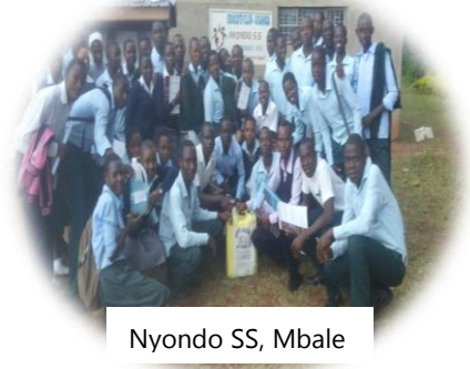
Nyondo SS, Mbale