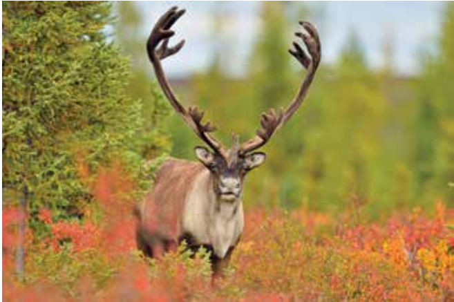
Some Inuit still hunt caribou, just as their ancestors did thousands of years ago.

and named after English explorer Henry Hudson, is frozen part of the year. Many of the people who live in these territories are Inuit. In fact, Nunavut has been set aside as a special Inuit homeland.