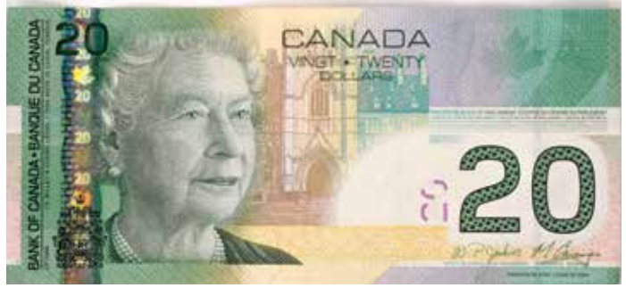
The Canadian twenty-dollar bill