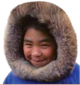
Smiling Inuit girl