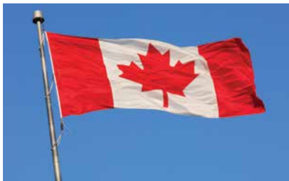
The maple leaf, shown here on the Canadian flag, is Canada's national symbol.

and the French came to Canada. For years most people called them Indians, but now many Canadian indigenous groups prefer to be called either First Nations or First Peoples.