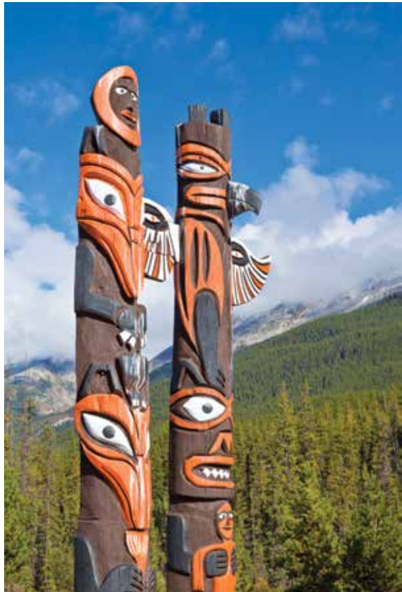
Totem poles are part of the indigenous culture of western Canada.

totem pole , n. a tall, wooden pole with carvings of people and animals used by the people of western Canada for religious purposes