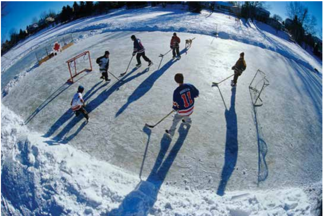
Hockey is a very popular sport in Canada.

indigenous , adj. native to a particular area or environment