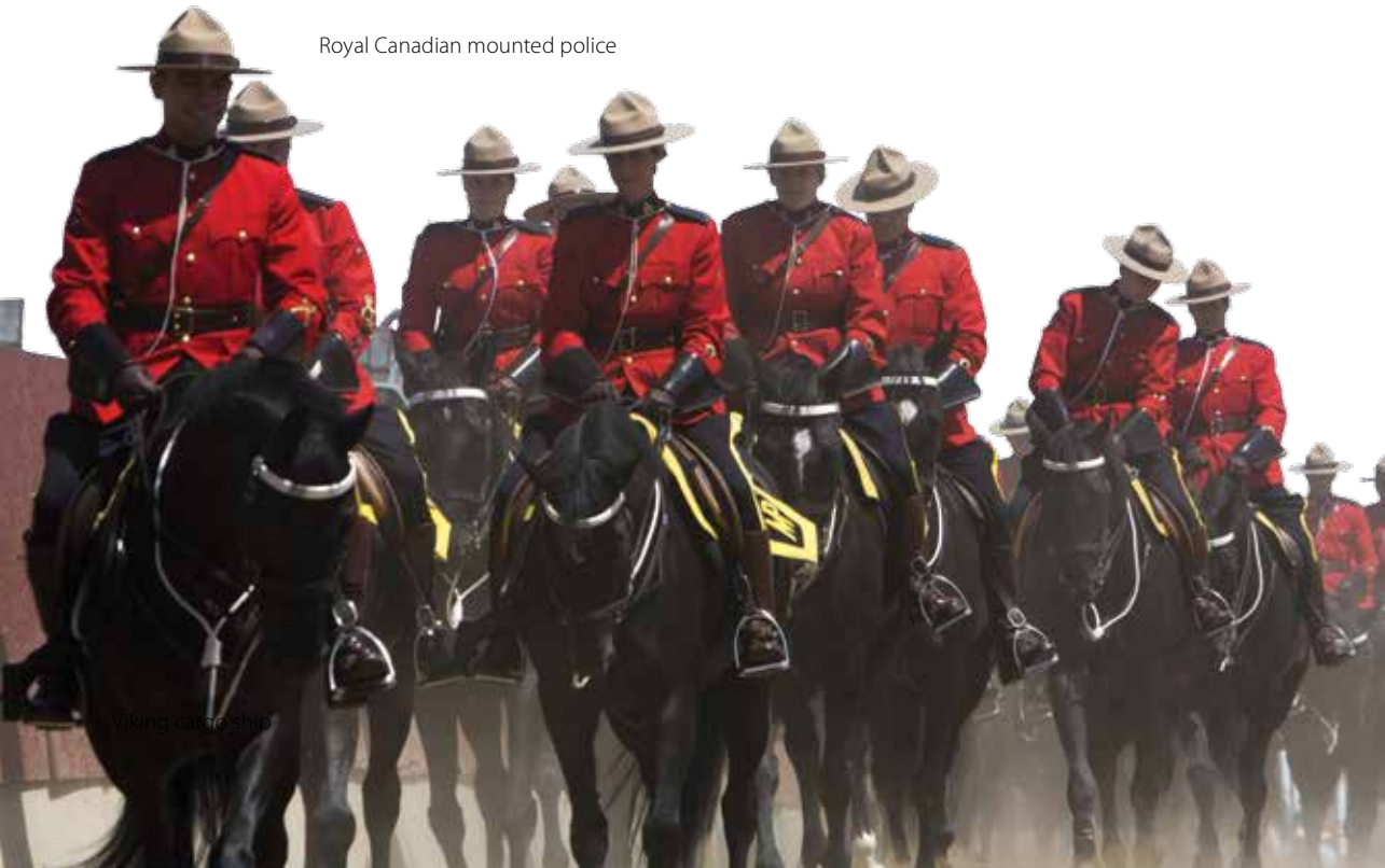
Royal Canadian mounted police