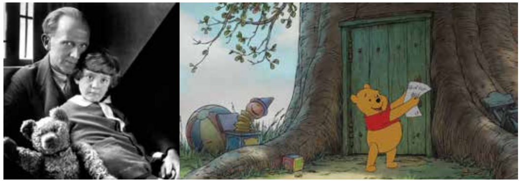
A Canadian bear inspired A.A. Milne to create the character Winnie-the-Pooh.

One day, an English writer saw the bear in the zoo. He noticed that the bear’s name was Winnie. (The Canadian soldier had named her